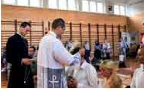
Below and adjacent: Enrolment into the Militia Immaculatæ in a temporary chapel in Częstochowa

I was very glad to observe the ancient pious custom of hospitality towards pilgrims: people from the villages that were on our way