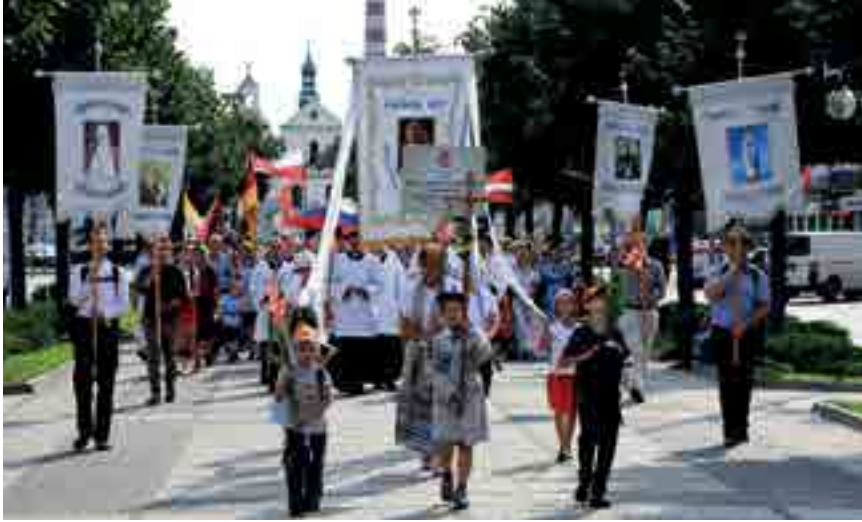
Pilgrims in Avenue of Our Lady in Częstochowa, before entering to the chapel of Miraculous Image of Our Lady

cordially greeted us and offered water, food and even accommodation on our overnight stops!