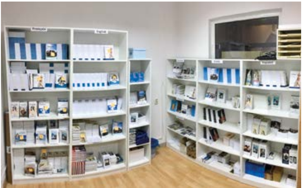
In the photo: stockroom of main publications in seven languages (English, French, Spanish, German, Russian, Dutch and Polish)

Some of these items can be downloaded as pdf files. Many of the published books, booklets and flyers can be ordered either from the Headquarters of the M.I. (Warsaw, Poland) or Kolbe Publications in Singapore.