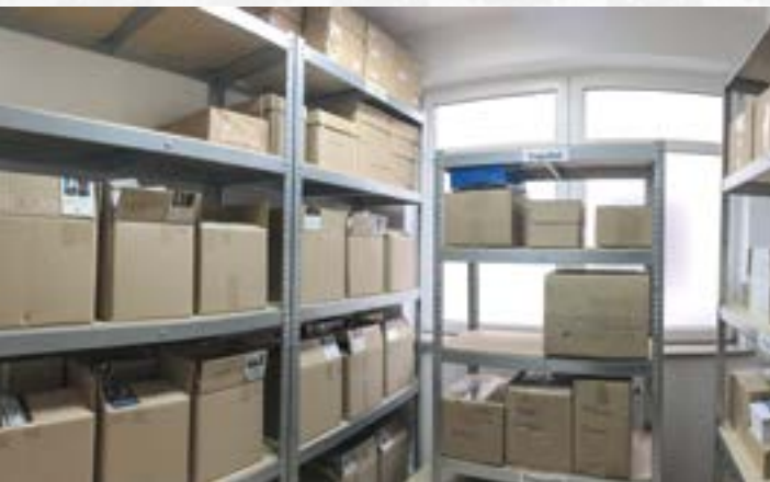
In the photo: stockroom of flyers in many languages

M.I. Flyers are prepared in twelve languages :