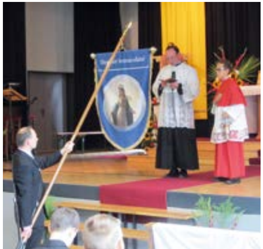
Blessing of the M.I. Banner in Switzerland

Through his absolute trust in the Immaculata, the victors in all God's battles; through his burning love for souls: "I exist for the salvation of souls — that is my mission"; through his clear anti-liberalism and anti-ecumenism,