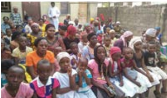
Knights in Makurdi

In Makurdi, the chaplain of the Oratory of St. Patrick extremely busy with the faithful, trying to raise the M.I. banner in a strategic place in the chapel, and making sure everything was ready for the enrolments,