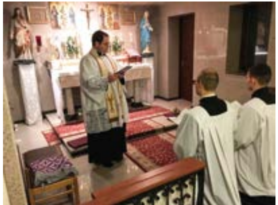
New Knights in Lithuania

The revolution brought about by the Second Vatican Council did not spare the M.I. either: