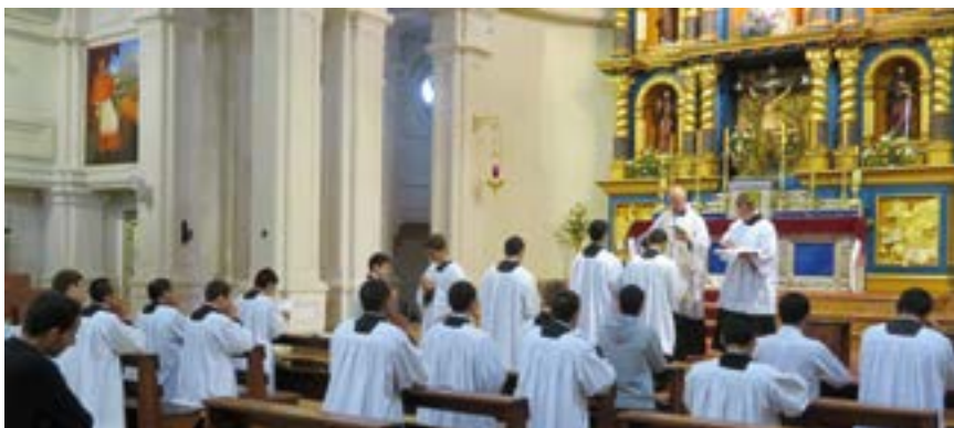
Enrolment into the M.I. in Seminary in La Reja (Argentina)