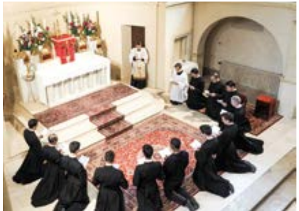
Enrolment into the M.I. in Seminary in Flavigny (France)

This last point is very important because, as with St. Maximilian, the local apostolate largely depends on them.