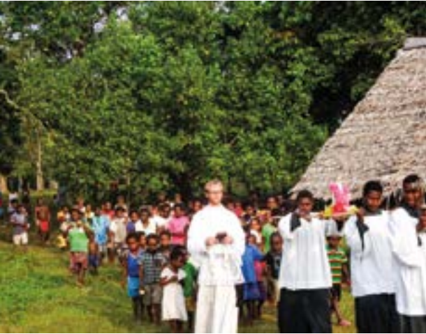
Knights in Vanuatu (the island in the Pacific Ocean) organized pilgrimage after enrolment into the M.I.

Besides the Franciscans, the Dominicans and contemplative Dominicans were interested in the Militia Immaculatæ.