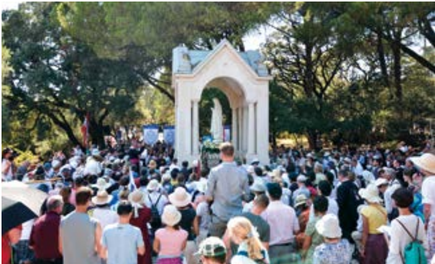
Knights of the Immaculata in Fatima (2017)

At the same time the Superior General wrote to the Superiors of the Priestly Fraternity inviting them to get to know this important apostolic means. Thus the interest in the M.I. grew more and more.