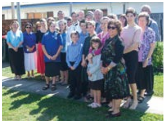
Knights in Mackay (Australia)

God has determined that He usually only gives His graces to people when He has instruments that help Him. In this way, Christ,