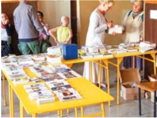
Temporary bookstore after the Pilgrimage in Czestochowa

1. The name: they began by changing the supposedly all-too-militant name of Militia (Knighthood) Immaculatæ to "Mission of the Immaculata", so as to correspond better with the principles of religious freedom and conciliar pacifism. Soon afterward, the Statutes were adapted to the spirit of the Council. The quotations in the new Statutes are taken exclusively from conciliar texts and the writings of Pope Paul VI and Pope John Paul II, along with a few quotations from St. Maximilian.