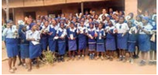
Young Knight in the school