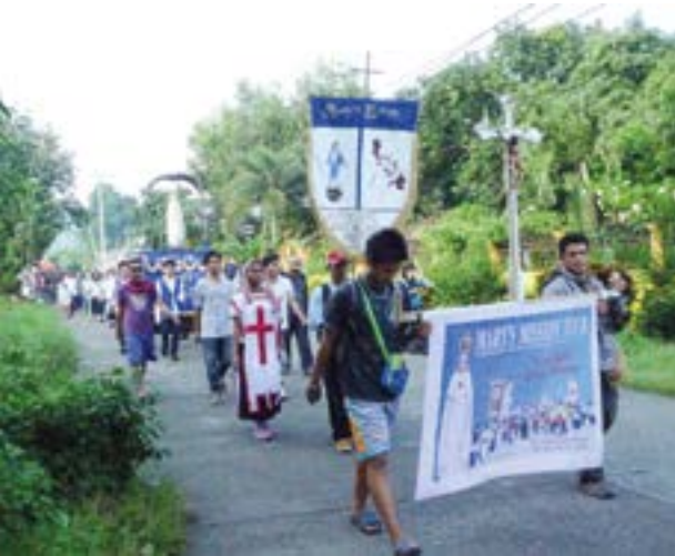
In 2016 Knights in the Philippines organized Mary Mission Tour — the pilgrimage through whole Philippines. The pilgrimage finished in 2017

the Redeemer and eternal High Priest will continue his work of salvation in space and time only with the help of the priests. Thus Mary, the Mediatrix of all graces, will also only give her graces of conversion and sanctification when she has instruments, channels, as it were, through which the living waters of divine life pass from her heart to the hearts of her often completely lost children.