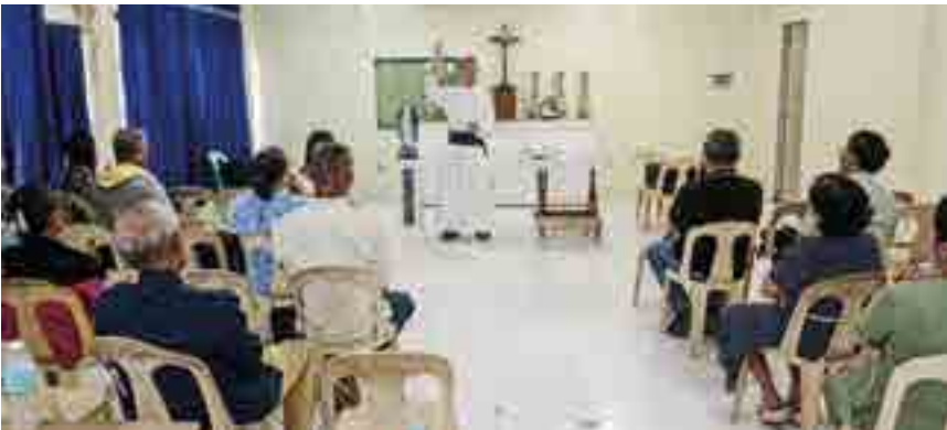
Preparation for the renewal of the consecration to the Immaculata in Bohol

And so every renewal of one's Consecration augments this Divine Economy and reminds us to be more fervent and more generous in the service of our unconquerable Queen.