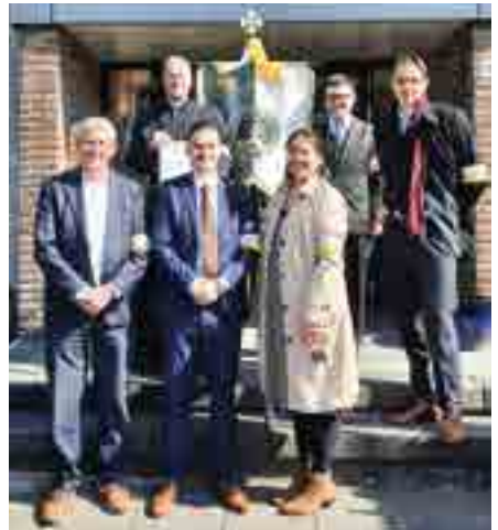
Members of the St. Catherine of Siena Foundation – the M.I. 2 Grade

Restoration: We clean and restore religious statues in public spaces and churches to restore the dignity of our Holy Faith.