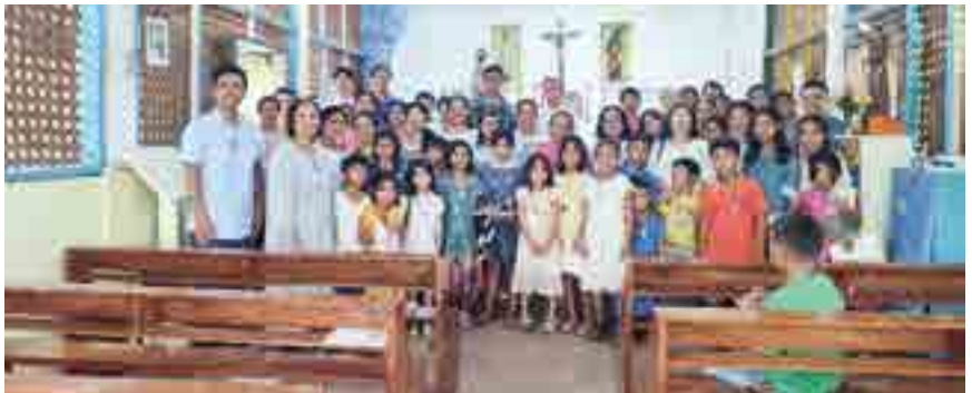
Knights of the Immaculata in Camotes

Now this is exactly the profound plan of God for every