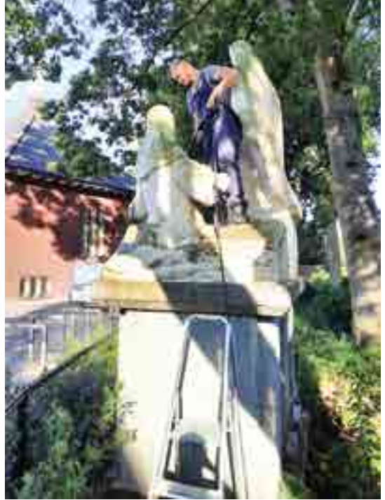
Cleaning and caring for Catholic statues